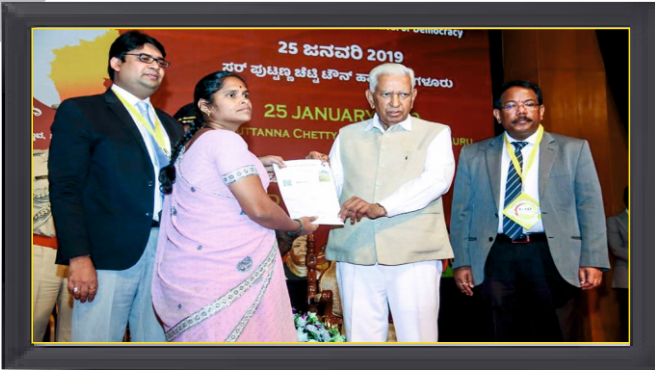
Braille EPIC Card issuing by His Excellency Governor of Karnataka