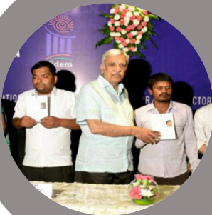
Braille EPIC Card launched by CEC on 18 July, 2018

Led the innovation in creating and printing Braille Elector Photo Identity Cards, which were officially launched by the Chief Election Commissioner of the Election Commission of India on July 18, 2018. Additionally, engineered a software application dedicated to producing Braille Elector Photo Identity Cards directly from the ECI Database.