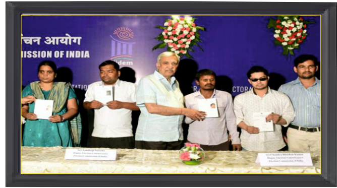
Braille EPIC Card launched by ECI on 18 July, 2018