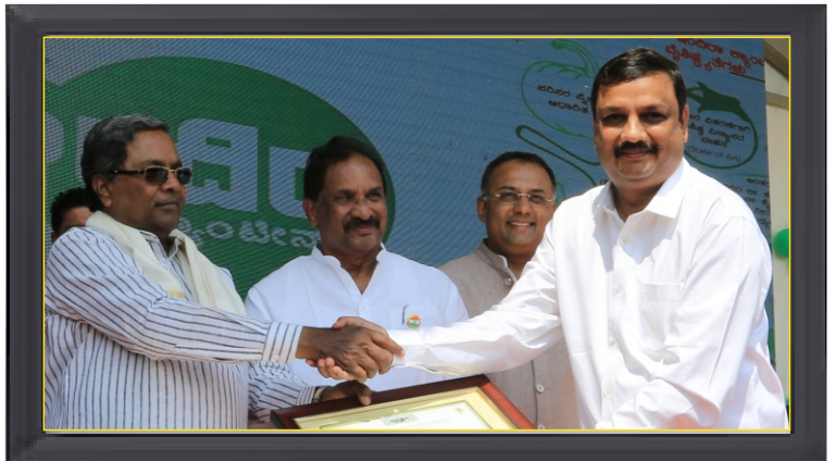
Certificate of Appreciation from Hon, Chief Minister, Karnataka