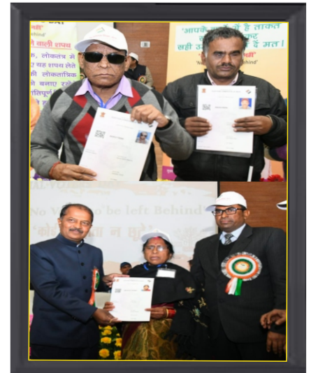
Braille EPIC Card Issuing by District Magistrate, Patna, Bihar