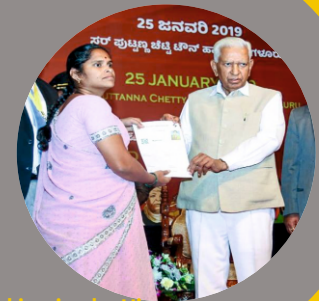
Braille EPIC Card issuing by His Excellency Governor of Karnataka