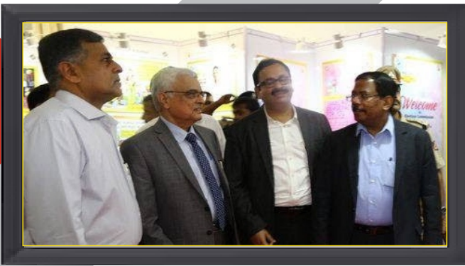
Photo Exhibition of Voter Awareness of Karnataka General Election 2018 under SVEEP activities